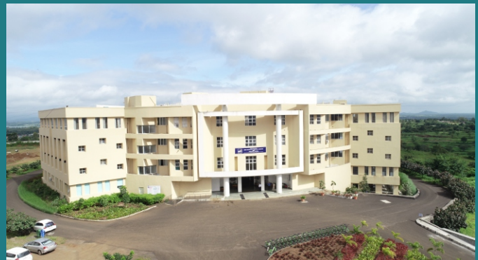
SMBT Institute of Medical Sciences & Research Centre, Nashik.