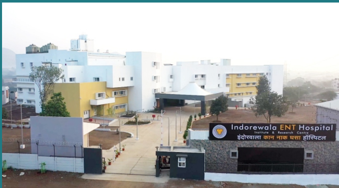
Indorewala ENT Hospital, Institute & Research Centre, Vilholi, Nashik.

SMBT Institute of Medical Sciences & Research Centre, Nashik.